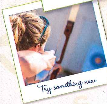
Try something new