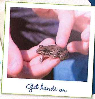
Get hands on