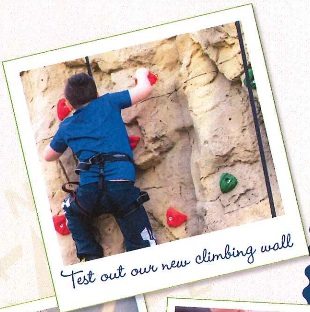
Test out our new climbing wall